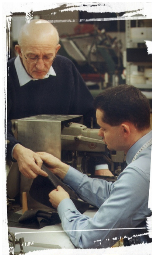
FROM IV TO V GENERATION